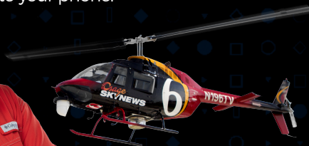
Dustin Stone, Osage SkyNews6 Pilot

A TORNADO WATCH is used to alert you to the possibility of tornado development in your area. A TORNADO WARNING is issued when a tornado has actually been sighted or is indicated by radar. If we alert you to threatening conditions, ACT FAST!